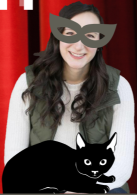
MISTRESS OF MYSTERY